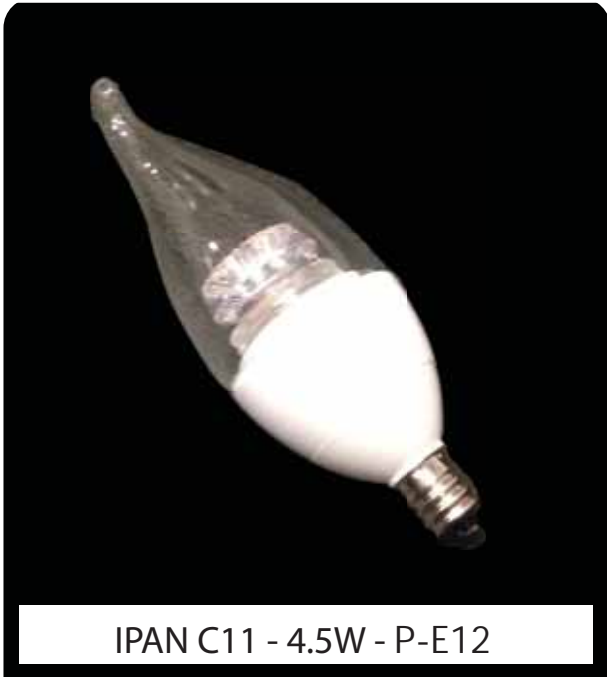
IPAN C11 - 4.5W - P-E12